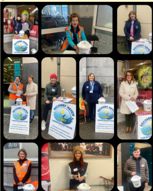
Just a handful of our collectors out and about in Tralee