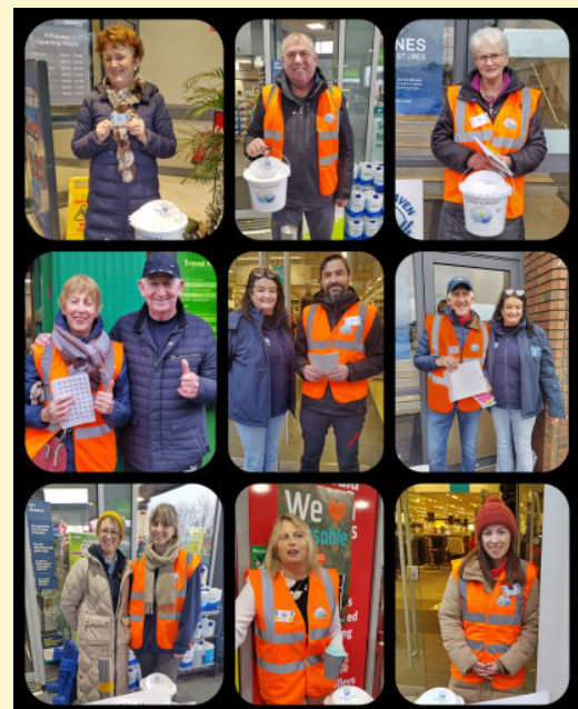
... And some more who gave up their time in Killarney

Of course, none of this would have been possible without our wonderful team of staff and volunteers on the ground who gave of their time to help us in each town. And a special thank you too to our new volunteers who came on board this year for the first time. We are so grateful to you all and so touched by your kindness and support.