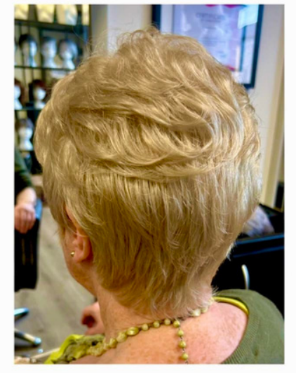
Another Happy Lady Leaving Today With New Hair 🥰